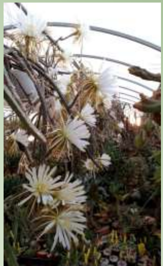
Selenicereus (Night Blooming Cereus)

I do the summer growers like cacti and euphorbias during the summer and try to do my euphorbia cuttings in May and June. They like the summer heat and root quickest at this time of year. I prefer to do my Haworthias in fall and spring when they are the most active and leave the winter growers like Conophytums for December to transplant and find that cuttings root well at that time of year.