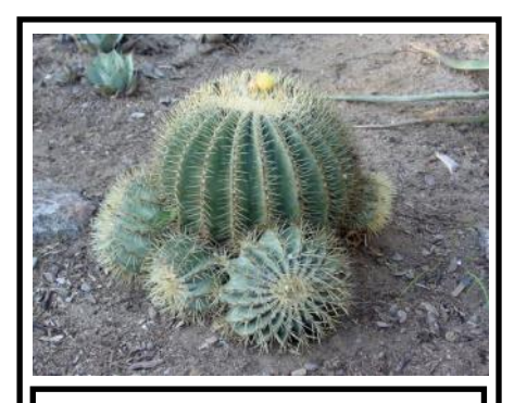
Ferocactus (a.k.a. "Barrell" Cactus)

The genus Ferocactus consists of roughly 30 identified species, the "barrel" cacti. These popular and easily grown plants are famous for being the "desert traveler's friend" and have been romanticized by Hollywood and folklore for their proclaimed usefulness. The reality that one must consider, however, is that many cacti, especially Ferocactus , grow in serpentine soil, which is high in alkaline content, like lime-