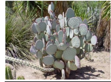
Opuntias: Top photo: Santa-Rita; Right photo: Robusta