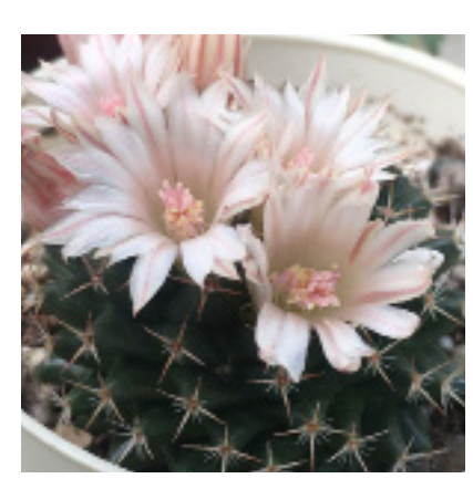
Mammillaria perbella sown 2017, flowering 2020.

Grow your seedlings much as you would any other cactus or succulent. You may have to watch watering more closely to avoid soaking seedlings with a limited root system or provide them some shelter from full sun. Fertilize regularly. I use a combination of slow release fertilizer early and mid season and liquid fertilizer all summer. By the end of the year, your seedlings should be shoulder to shoulder and begging to be transplanted. Don't listen to them, leave then in the pot through the winter season. Your plants are now one year old.