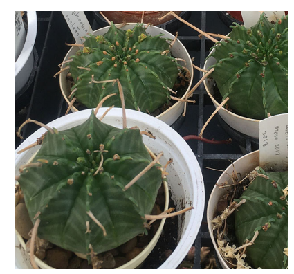
These Euphorbia meloformis were sown in 2017, transplanted in 2018 and began producing flowers and seed in 2019.

I have started to experiment with nurse plants if I have had poor germination and only one or two seedlings growing. I will take a leaf from a jelly bean plant or burro's tail and drop it into the pot. The lone cactus seedlings "seem" to do better and the nurse plant can be removed during transplanting or just cut off at ground level when the cacti are established.