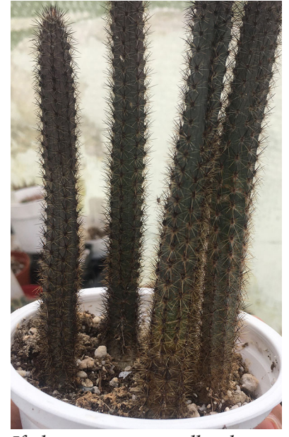
If plants are too small to be on their own, you may need to first transplant them to community pots until they mature a bit more.