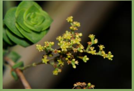
Crassula "blue bird" flower (top) and perforata flower.