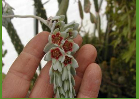
Pachyphytum oviferum plant (top) and flower (bottom).

Kalanchoe: rhombopilosa (right) and pumila (bottom).