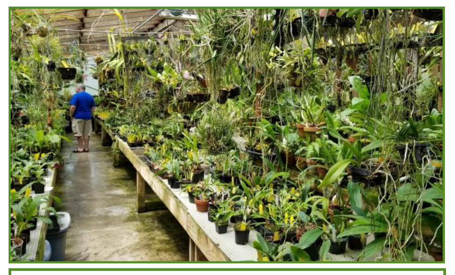
An inside view of the orchid greenhouse at Windswept in Time.

Plants for sale: Orchids and a nice selection of succulents/cacti.